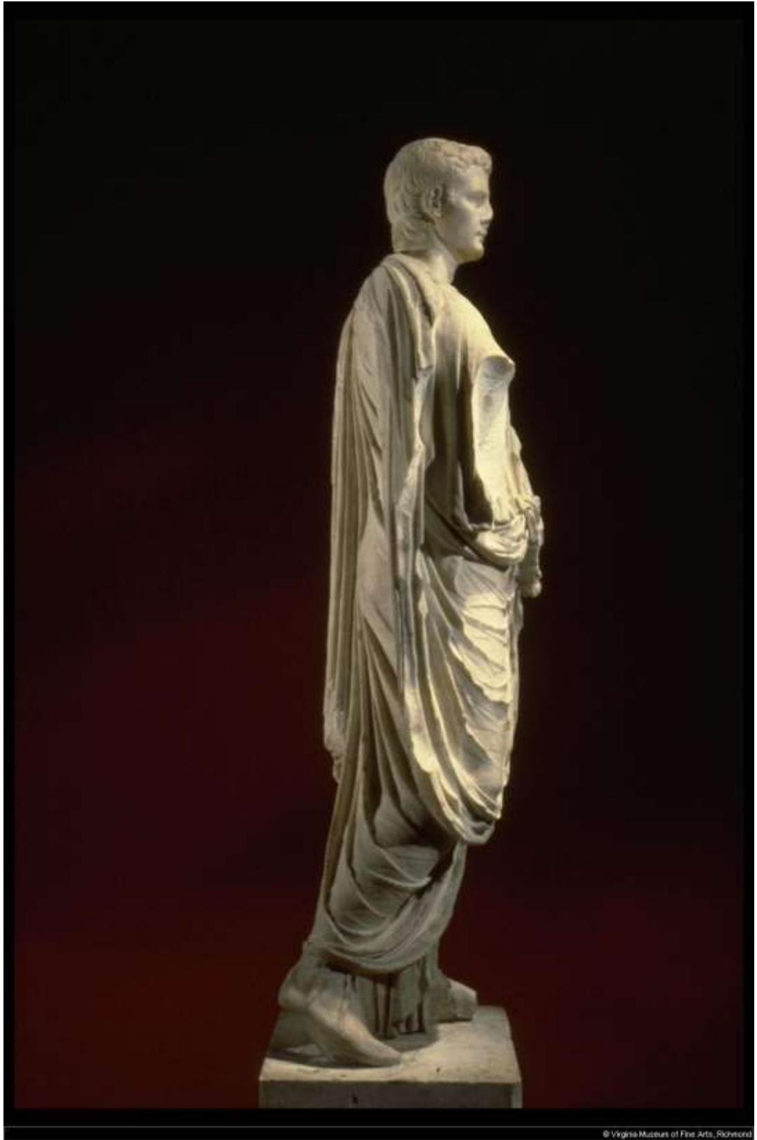
Figure 8. The Richmond Caligula.