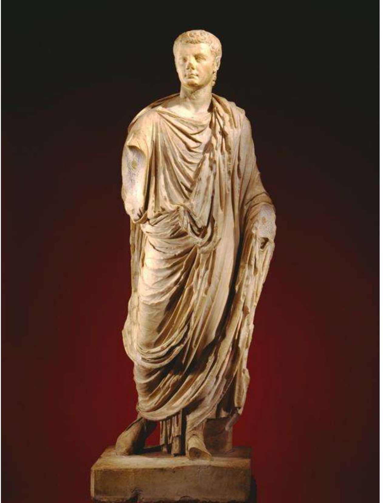
Figure 5. The Richmond Caligula.