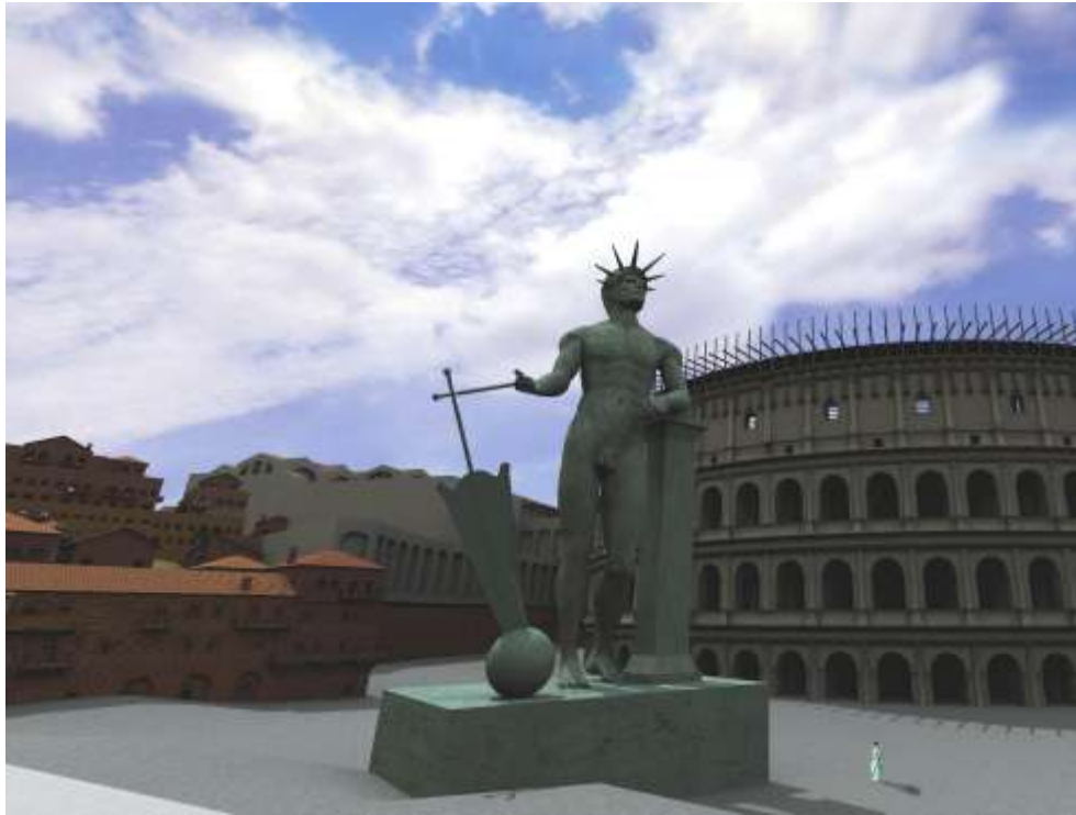
Figure 3. A still shot of Rome Reborn 2.0, an interactive digital model of ca. 7,000 buildings covering over 25 sq. km. of space in the year A.D. 320. In this shot we see the colossal bronze statue (100 Roman feet tall) of the Sun god in the plaza to the west of the Flavian Amphitheater (called “Colosseum” because of its proximity to this statue). The image shows the utility of 3D digital architectural models such as “Rome Reborn” to recontextualize works of art. In the “Caligula” project, we will provide such recontextualization by putting the 3D digital reconstruction model of the statue into a digital model of the architectural space where it was found: the imperial cult sanctuary at Bovillae, 18 km south of Rome.