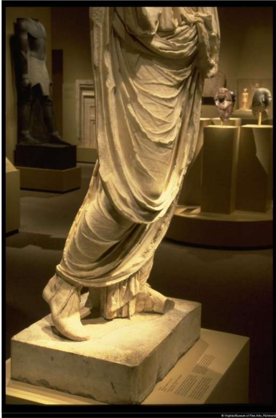
Figure 9. The Richmond Caligula.