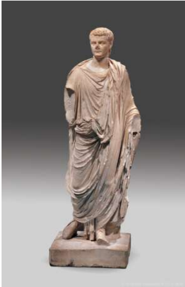
Figure 1: The focus of the project: the marble statue of Caligula in the Virginia Museum of Fine Arts. The Arthur D. and Margaret Glasgow Fund, 71.20. For additional views of the statue, please see figures 5-9 in Appendix III.

This project aims to increase scholarly and public understanding of one of the most important works of Roman art in an American public collection: the over life-size statue of the Emperor Caligula in the Virginia Museum of Fine Arts in Richmond, Virginia (figure 1). The goals of the project are to: (1) undertake new interdisciplinary and technical studies of the Richmond Caligula; (2) present our preliminary findings at a public conference; and (3) make the final results available at no cost over the Internet.