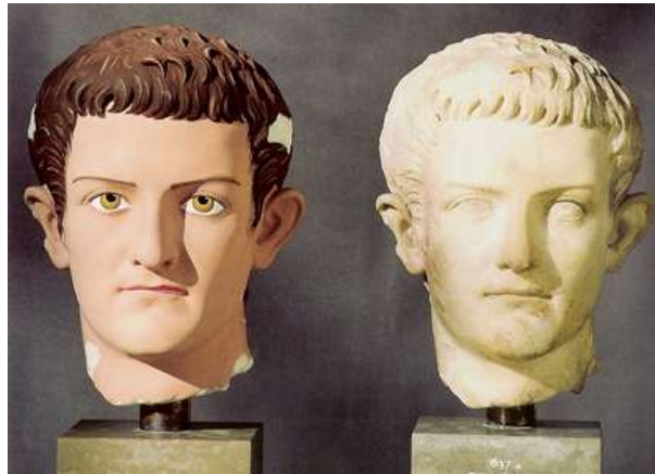
Figure 2. Head of the Roman Emperor Caligula. Copenhagen, Ny Carlsberg Glyptotek 2687. Left: marble copy A of the head with polychromy restored (Østergaard 2004: 253, fig. 366). See also figure 10 in Appendix V for a larger reproduction of the color copy A and note the alternative reconstruction (copy B) in figure 11.

We aim to provide the first in-depth study of this remarkable statue, an undertaking that is interdisciplinary in method and which relies heavily on digital technologies at the stages of both analysis and publication.