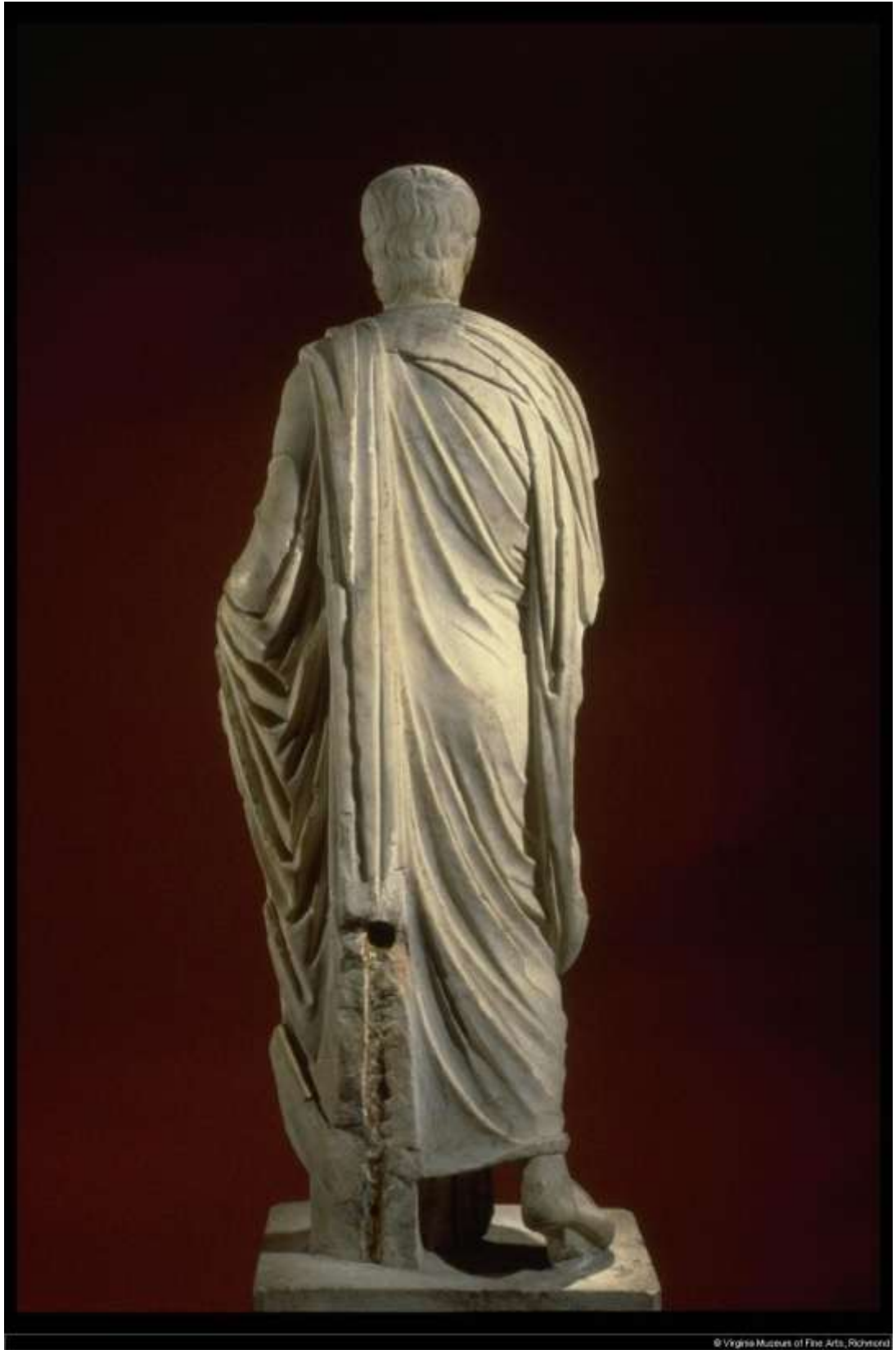
Figure 7. The Richmond Caligula.